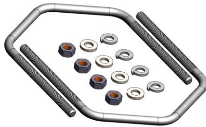
KONA Mounting Kit